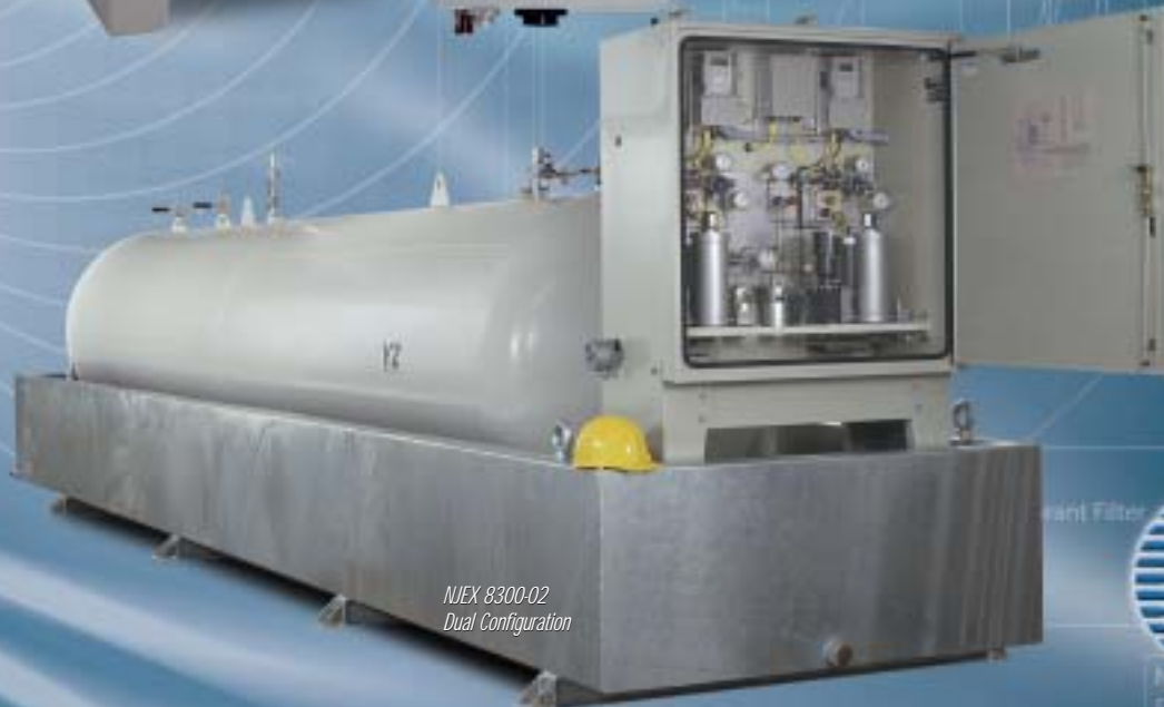
NJEX 8300-02 Dual Configuration