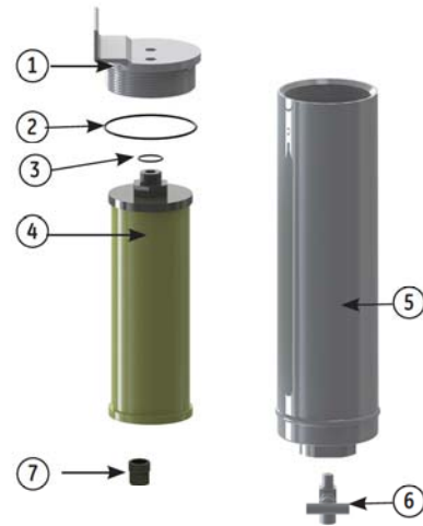
Figure 2 - FD-1500 Filter-Dryer (exploded view) Exploded view of the FD-1500 illustrates the unit's simplicity.