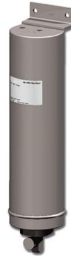
Figure 1 - Becker FD-1500 Filter Dryer